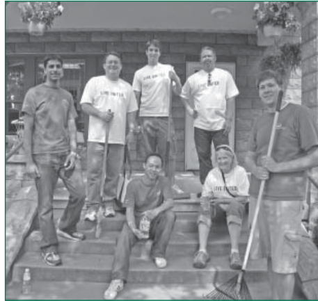
Intel and United Way employees show their satisfaction after three hours of work sprucing up the Hillsboro Family Shelter. Thank you volunteers! Your contributions help enormously!