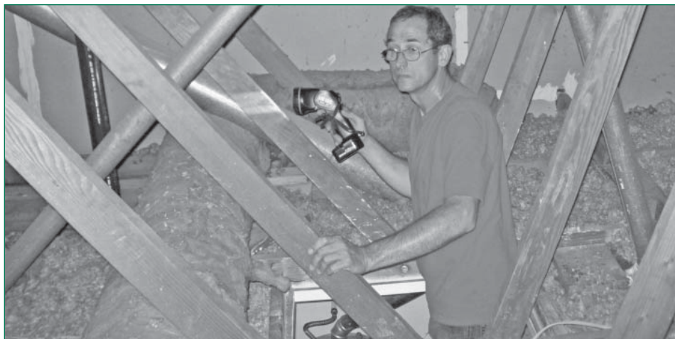
Families and businesses will benefit as Community Action's Weatherization Program gets a boost from the American Recovery and Reinvestment Act.

Weatherization: It is expected that 600 additional families will be provided with home energy assessments and energy education. Half of these families will also receive comprehensive services to increase the health, safety and energy efficiency of their homes. This will generate significant business activity as local contractors are hired and materials are purchased to complete these home improvement and efficiency initiatives.